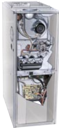
Heil QuietComfort VS 80 Gas Furnace

Mike Eberlein, ICP furnace product manager, said this series replaces the previous models of Heil variable speed 80% furnaces and availability of the new units for customer shipment is expected in September 2006.