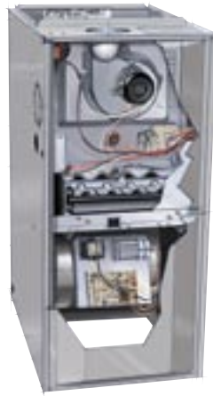
Heil QuietComfort DLX 80 Gas Furnace

✓ Simplified troubleshooting – These 80% furnaces are equipped with a troubleshooting LED fault indicator that will diagnose practically all system-related malfunctions, and it's easy to view through a sight glass in the blower door. Conventional gas valves also come standard on these furnaces to provide easy replacement and troubleshooting. The control board mounting plate has been modified for easier