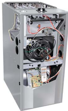
Comfortmaker SoftSound™ VS 95 Gas Furnace

operates on quieter low fire unless the thermostat calls for high fire. As an added bonus, when two-stage furnaces operate on low fire, they run on longer cycles to keep the home heated more evenly.