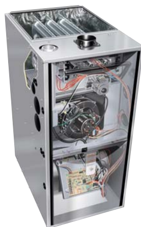
TEMPSTAR® SMARTCOMFORT™ VS 95 GAS FURNACE